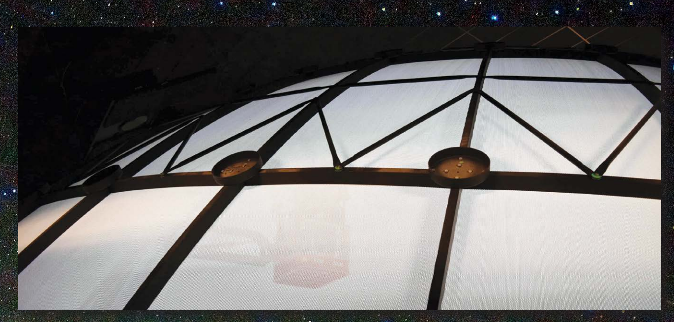
Our planetarium dome is an assembly of 197 perforated panels that contain nearly 7500 tiny holes per square foot. Note that one of the lifts can be seen through those tiny holes from the back side of the dome.