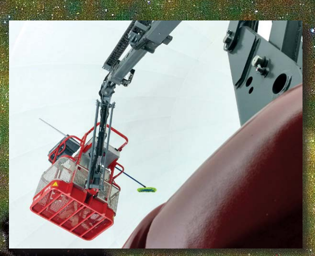
Accessing the upper portions of the dome required the lift to extend nearly 35 feet above the planetarium floor.